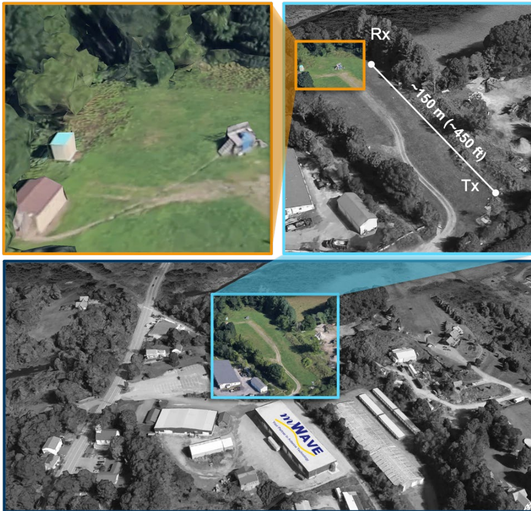
Figure 1: mWAVE Test Facility in Windham, ME