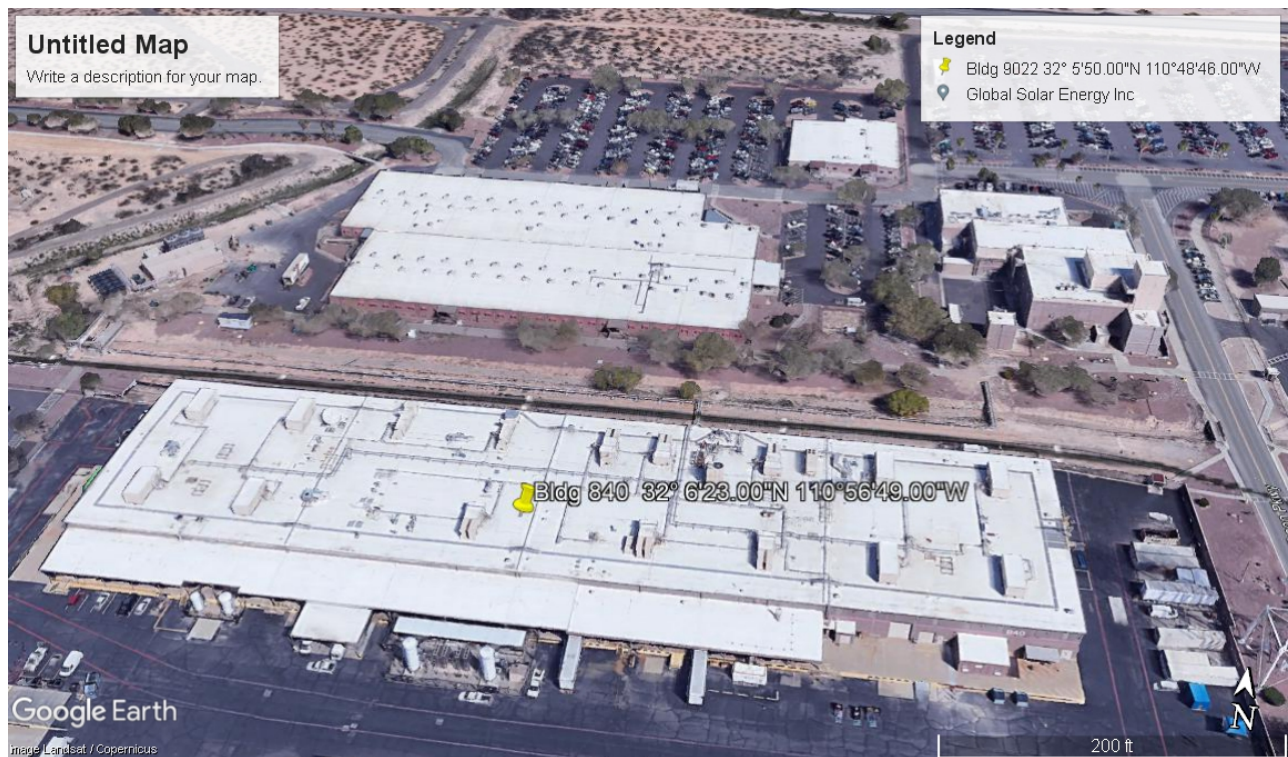
Figure 3. Building 840, with pushpin marking the lab on the Raytheon Plant