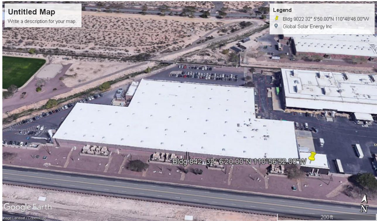
Figure 4. Building 842, with pushpin marking the lab on the Raytheon Plant