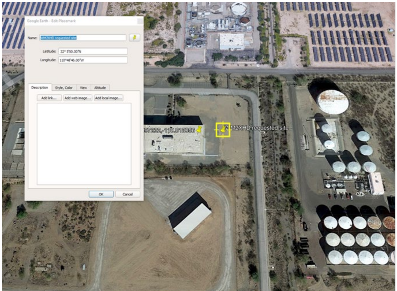
Figure 1. Building 9022, with pushpin marking the lab on the Raytheon Plant

The testing will be conducted at several Tucson plant site, fixed location at the locations depicted in the below Figure 1- 5.