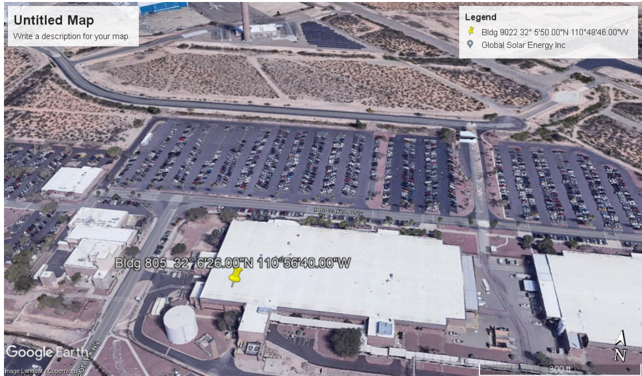
Figure 2. Building 805, with pushpin marking the lab on the Raytheon Plant