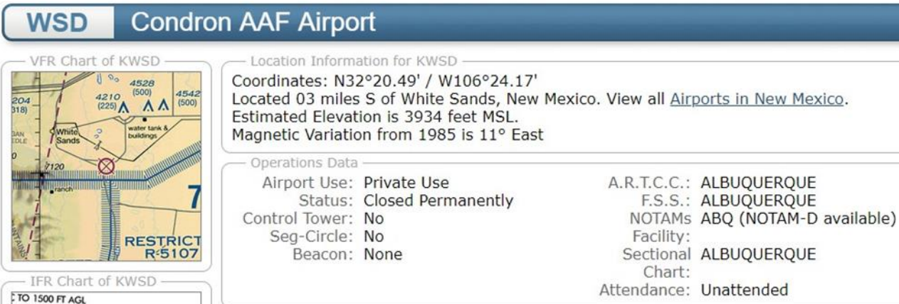
Figure 2: Screen capture of skyvecotr.com listing for Condron AAF showing that it is "Closed Permanently" and "Unattended"

Testing at any given facility will be limited to 2 months in duration. Testing may be conducted during extended normal working hours from about 7:00 AM to 7:00 PM local time. However, hours may be adjusted to accommodate facility or spectrum management operational requirements.