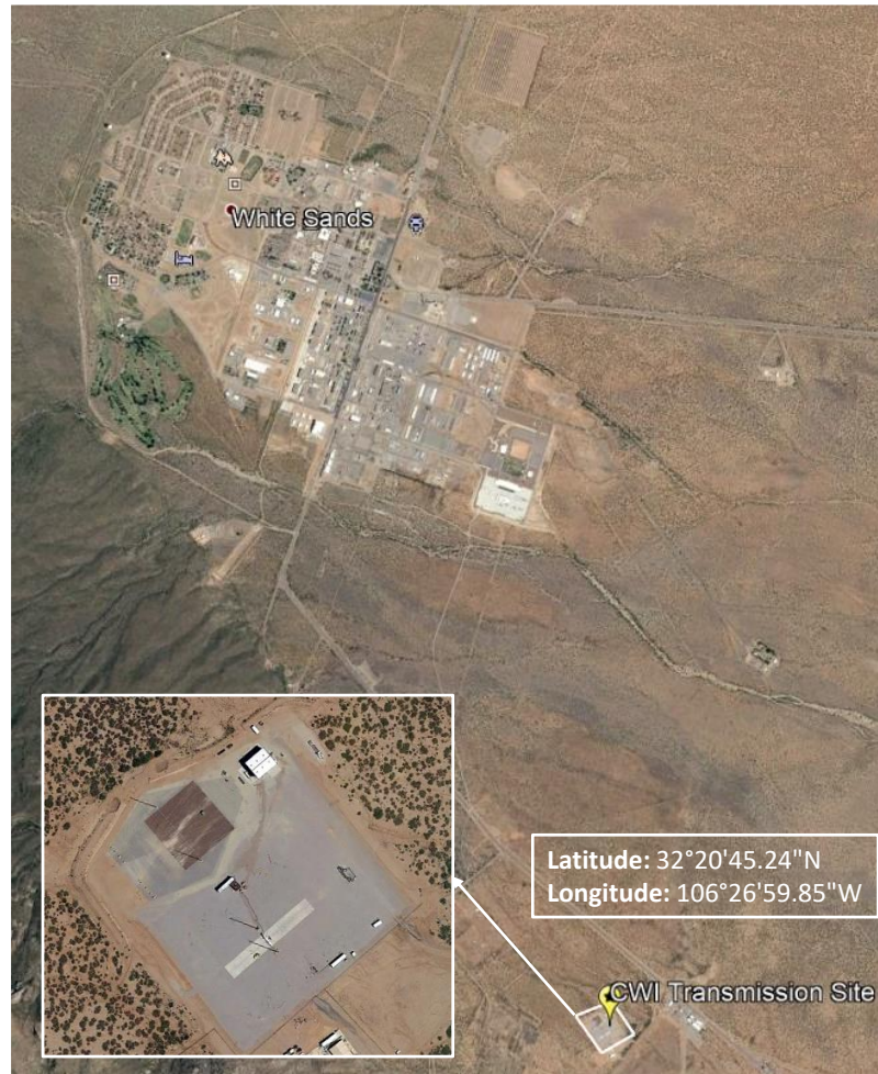
Figure 1: Location of temporary transmission site.

This Special Temporary Authorization (STA) application is for the purpose of conducting MIL-STD-188-125 Volume 2 Continuous Wave Illumination Testing (CWI). The proposed CWI testing will be conducted at the AFEMPS and VEMPS facilities at White Sands Missile Range (WSMR). A map of the test location is shown below in Figure 1. As can be seen, the transmission will take place at coordinates 32° 20' 45.24"N, 106° 26' 59.85"W.