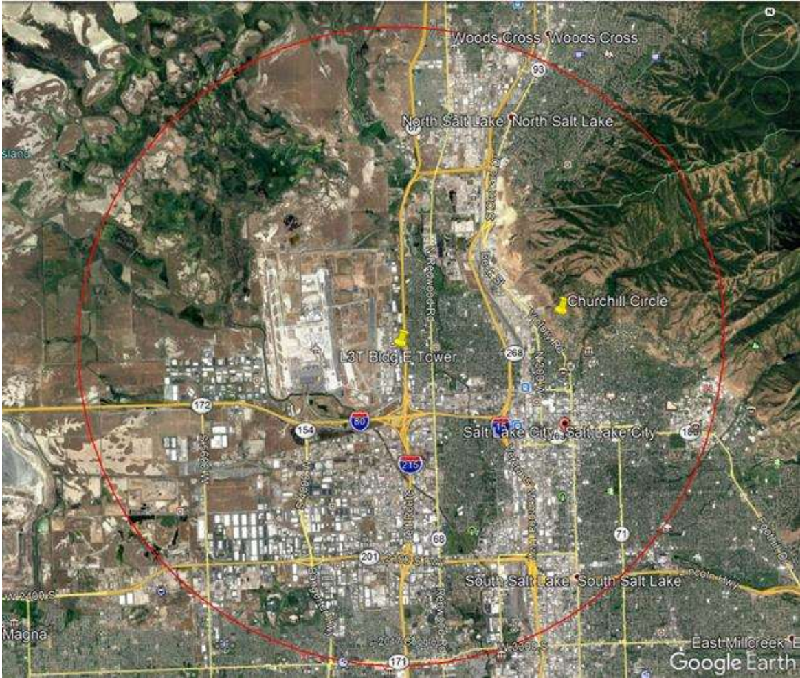
Figure 2 Building E to mobile station